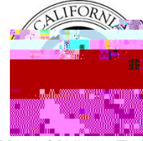
CALIFORNIA COMMUNITY COLLEGES