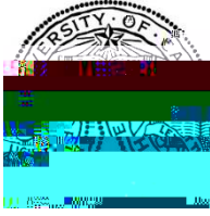
THE UNIVERSITY OF CALIFORNIA